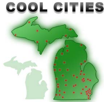
Figure 1: Cool Cities in Michigan

program progress, focusing on innovation, talent, diversity, and workforce. Each participating city chooses its own unique aspects to focus on.